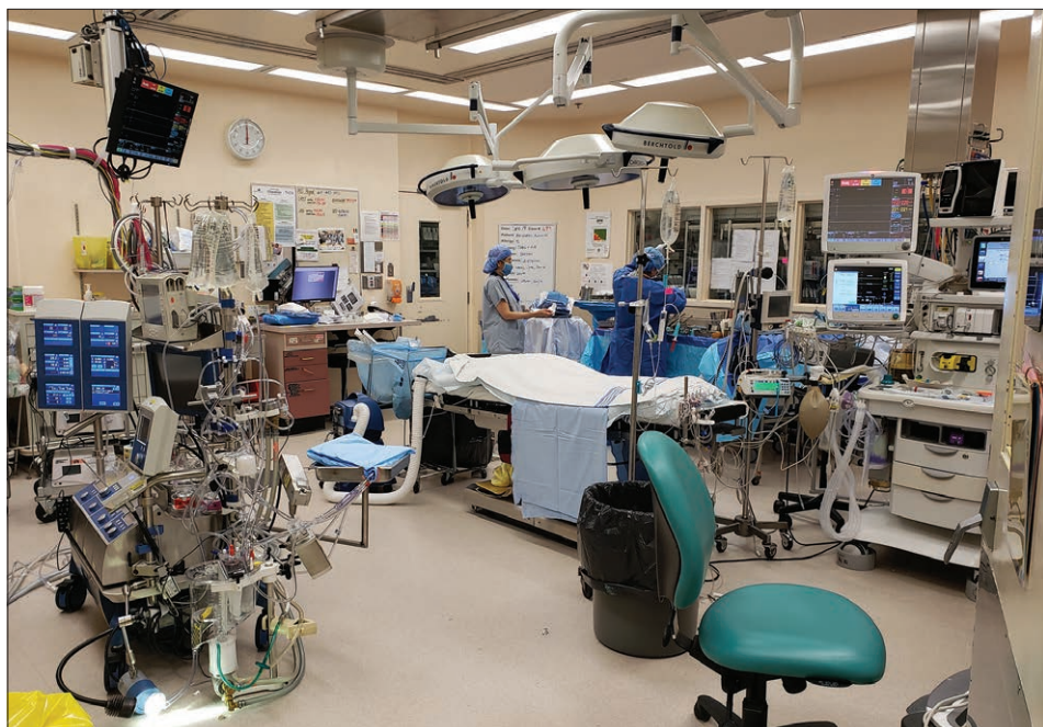
The Cardiac operating theatre at Royal Columbian Hospital.

The first heart catheterization was performed at RCH in November, 1969. Currently, about 6,000 catheterizations are done each year. Angioplasty initially involved a few cases per week and has grown to 2,935 during the 2017–18 year, the most in Canada. In addition, Royal Columbian Hospital is