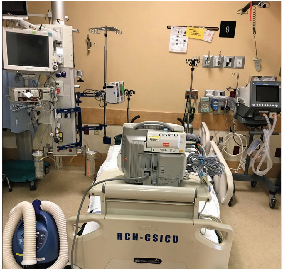
The Cardiac Surgery Intensive Care Unit (CSICU) at Royal Columbian Hospital.

The 2 South ward located in the Columbia Tower holds 30 beds. Patients are initially moved to the Cardiac Surgery Intensive Care Unit (CSICU) after surgery. Within a day or two they are taken to a room on 2 South. There, care and treatment are administered by about 60 specially trained nurses, as well as dietitians, physiotherapists, clinical pharmacists and social workers.