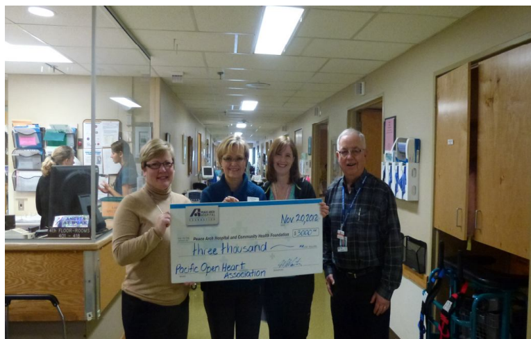
Peace Arch Hospital (PAH)