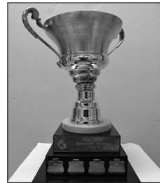
Don Topp Trophy